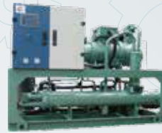
◆ Condensing Unit Cooling Capacity Range: 17KW~2218KW Min. Evaporation Temperature: -10°C~-40°C