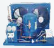
◆ Fully Closed Piston Compression Condensing Unit Cooling Capacity Range: 8KW~20KW Min. Evaporation Temperature: -20°C