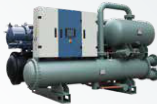
◆ Flooded Type Low Temperature Chiller Cooling Capacity Range: 229KW~1625KW Chilled water outlet temperature range: 10~-15°C