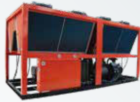
◆ Cold Recovery / Intelligent Hot Water Unit Heating Capacity Range: 25.3KW~908.8KW Hot Water Max. Outlet Temperature: 55°C