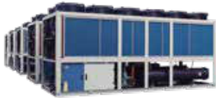
◆ Screw Air Source Heat Pump Heating Range: 80~4000Kw Hot water Temp range: 45°C~95°C Refrigerant: R134a, R407c, R1234ze