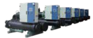
◆ Scroll Water Source Heat Pump Heating Range: 20Kw-1000Kw Hot water Temp. range: 40°C~70°C Refrigerant: R410a, R134a, R1234ze