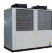
◆ Air-Cooled Scroll Industrial Chiller Cooling Capacity Range: 120KW~4003KW Chilled water outlet temperature range: 5~20°C