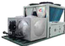
◆ Air Cooled Integrated Chiller Cooling Capacity Range: 15KW~150KW Chilled water outlet temperature range: 5~20°C