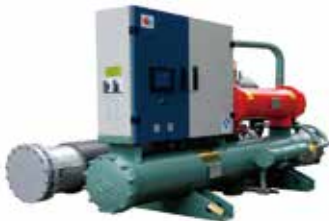
◆ Anti-corrosion Heat Recovery Chiller Cooling Capacity Range: 120KW~4003KW Chilled water outlet temperature range: 5~20°C