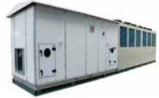
◆ (Heat Recovery) Integrated Unit for Mine Air Conditioning Cooling Capacity Range: 100KW~600KW Chilled water outlet temperature range: 5~20°C