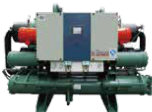
◆ Water-cooled Chilled with Heat Recovery Cooling Capacity Range: 120KW~4003KW Chilled water outlet temperature range: 5~20°C