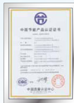
Energy Conservation Certification