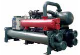
◆ (Heat Recovery) High Voltage Chiller Cooling Capacity Range: 1000KW~4000KW Chilled water outlet temperature range: 5~20°C