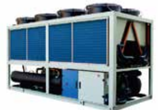
◆ Dual Source Heat Pump Cooling Capacity Range: 115KW~460KW Chilled water outlet temperature range: 55~85°C