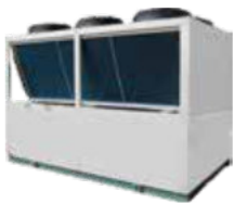
◆ Air-cooled Magnetic Oil Free Centrifugal Chiller Rated Cooling Capacity: 80TON~500TON Chilled water outlet temperature range: 5~20°C