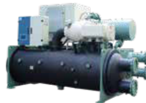
◆ Centrifugal Water-cooled Chiller Cooling Capacity Range: 450TON~2000TON Chilled water outlet temperature range: 5~20°C