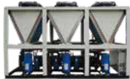
◆ Scroll Air Source Heat Pump Heating Range: 10Kw-1000Kw Hot water Temp range: 45°C~70°C Refrigerant: R410a, R134a, R1234ze