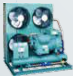
◆ Semi-closed Piston Compression Condensing Unit Cooling Capacity Range: 14KW~76KW Min. Evaporation Temperature: -20°C