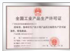
National Industrial Production Permit