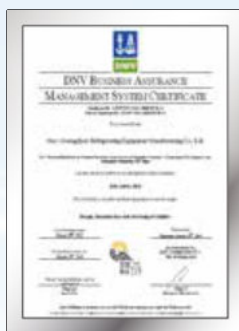
ISO 14001 Certificate