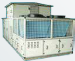
◆ Rooftop Package Unit