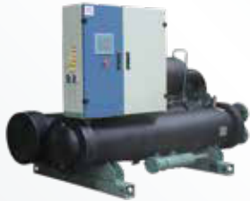
◆ 90 °C High Temp. Heat Pump Heating Capacity Range: 80KW~2111KW Hot Water Outlet Temperature Range: 65~90°C