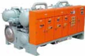
◆ ASME Chiller Cooling Capacity Range: 120KW~4003KW Chilled water outlet temperature range: 5~20°C