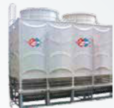
◆ Cooling Tower