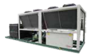
◆ Air cooled Screw industrial chiller Cooling Capacity Range: 148KW~920KW Chilled water outlet temperature range: 5~20°C