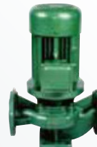
◆ Water pump