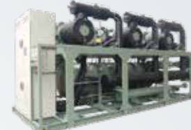
◆ Compressor Set Unit Cooling Capacity Range: 292KW~5117KW Min. Evaporation Temperature: -40°C