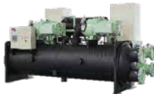
◆ Water-cooled Magnetic Oil-free Centrifugal Chiller Cooling Capacity Range: 100TON~1000TON Chilled water outlet temperature range: 5~20°C