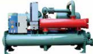
◆ (Heat Recovery) VFD Screw Chiller Cooling Capacity Range: 443KW~2111KW Chilled water outlet temperature range: 5~20°C