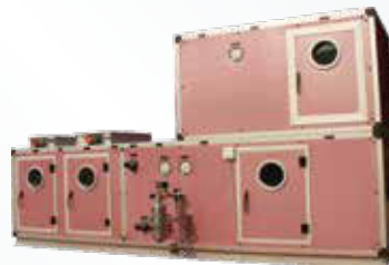
◆ Commercial Air handling Unit