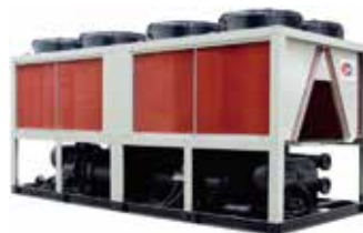
◆ Anti-corrosion Air-cooled Chiller Cooling Capacity Range: 109KW~675KW Chilled water outlet temperature range: 5~20°C