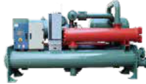
◆ Water Cooled Screw Chiller Cooling Capacity Range: 80Kw-4000Kw Chilled water Temp: 5°C~20°C Refrigerant: R407c, R134a, R1234ze, R404a