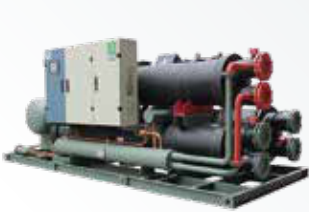
◆ Water Source high temperature Heat Pump Heating Capacity Range: 100KW~2111KW Hot Water Max. Outlet Temperature: 90~120°C