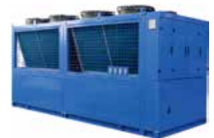
◆ Non-standard Voltage Air-cooled Chiller Cooling Capacity Range: 109KW~675KW Chilled water outlet temperature range: 5~20°C