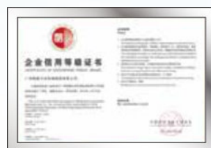
Enterprise Credit Evaluation