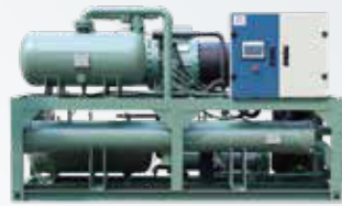
◆ Two-stage Compression Condensing Unit Cooling Capacity Range: 76KW~363KW Min. Evaporation Temperature: -45°C