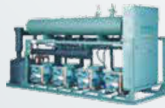
◆ Parallel Piston Compression Condensing Unit Cooling Capacity Range: 56KW~847KW Min. Evaporation Temperature: -45°C