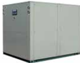
◆ (Heat Recovery) Scroll Sewage Source Heat Pump Cooling Capacity Range: 10.2KW~156KW Chilled water outlet temperature range: 5~20°C