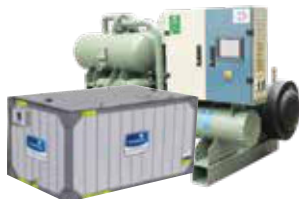
◆ Ice Storage Chiller Cooling Capacity Range: 15KW-4000KW Chilled water outlet temperature range: -8°C~12°C