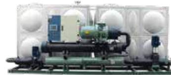
◆ Integrated Package Chiller Cooling Capacity Range: 100~6000Kw Inlet and Outlet Temperature: 1°C~20°C