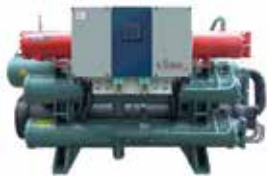
◆ (Heat Recovery) Water-cooled Screw Chiller Cooling Capacity Range: 92KW~1526KW Chilled water outlet temperature range: 5~20°C