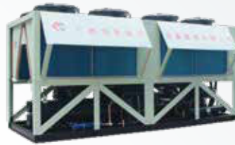
◆ 120 °C High Temp. Heat Pump Heating Capacity Range: 300KW~1000KW Hot Water Outlet Temperature Range: 90~125°C