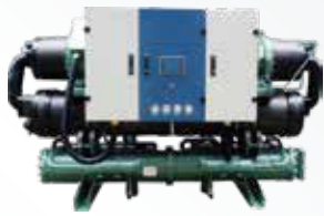
◆ Water-cooled Screw Low Temperature Chiller Cooling Capacity Range: 17KW~2369KW Chilled water outlet temperature range: 10~-35°C