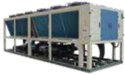
◆ Air Cooled Screw Chiller Cooling Capacity Range: 80~4000Kw Chilled water Temp: 5°C~20°C Refrigerant: R407c, R134a, R1234ze, R404a