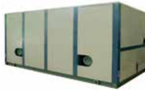
◆ Indoor Unit of an Evaporative Chiller Cooling Capacity Range: 433KW~2111KW Chilled water outlet temperature range: 5~20°C