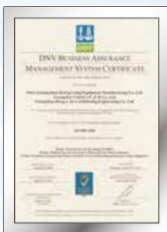
ISO 9001 Certificate

H.Stars Group will continue to develop energy saving and environmental friendly equipment to create "The Efficiency Planet" as our obligation. By focusing on customers' needs and wants in order to contribute more our potentials, from now on, H.Stars Group will hand in hand with you to be a shining star in the foreseeable future.