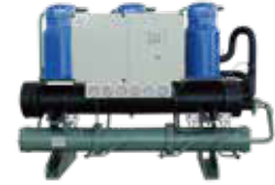
◆ Water Cooled Scroll Chiller Cooling Capacity Range: 10Kw-1000Kw Chilled water Temp: 5°C~20°C Refrigerant: R410a, R134a, R1234ze, R1234yf