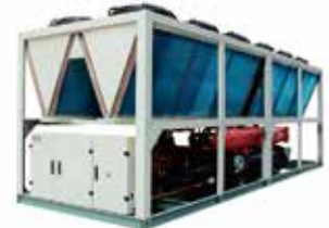
◆ (Heat Recovery) Dual-Source Heat Pump Cooling Capacity Range: 109KW~675KW Chilled water outlet temperature range: 5~20°C