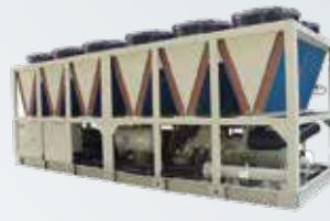
◆ Air Source High Temperature Intelligent Heat Pump Heating Capacity Range: 25KW~1000KW Hot Water Max. Outlet Temperature: 90~120°C