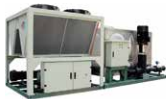
◆ High-precision Air-cooled Chiller Cooling Capacity Range: 109KW~675KW Chilled water outlet temperature range: 5~20°C