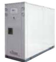
◆ Industrial Water Cooled Scroll Chiller (Box Type) Cooling Capacity Range: 10.2KW~156KW Chilled water outlet temperature range: 5~20°C