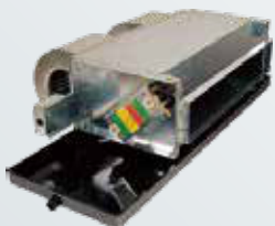
◆ Fan Coil Unit