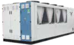
◆ Air Cooled Scroll Chiller Cooling Capacity Range: 10Kw-1000Kw Chilled water Temp: 5°C~20°C Refrigerant: R410a, R134a, R1234ze, R1234yf