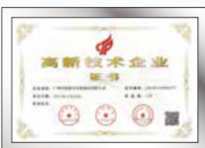
Hi-tech Enterprise Authenticated Certificate