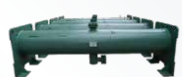
◆ Shell and tube heat exchangers