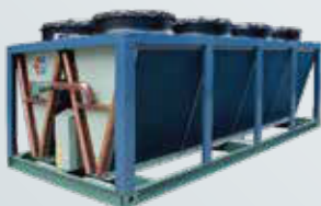
◆ Remote condenser