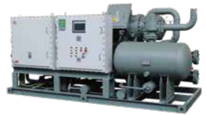
◆ Explosion-proof Chiller Cooling Capacity Range: 120KW~4003KW Chilled water outlet temperature range: 5~20°C