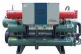
◆ Heat Recovery Industrial Chiller Cooling Capacity Range: 120KW~4003KW Chilled water outlet temperature range: 5~20°C