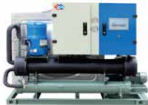
◆ High-precision Constant Temperature Cooling Capacity Range: 20KW~500KW Temperature Accuracy: \pm 0.1^{\circ}\text{C}