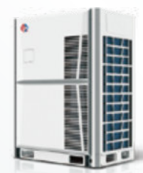
◆ VRF unit