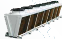
◆ Air-cooled Condenser Heat Exchange Capacity Range: 9.34KW~1611KW