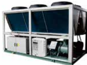
◆ VFD Air-cooled Chiller Cooling Capacity Range: 109KW~675KW Chilled water outlet temperature range: 5~20°C