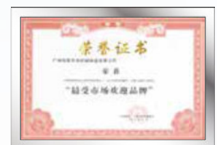
Market's Favourite Brand