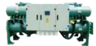
◆ Falling Film Water Cooled Chiller Cooling Capacity Range: 443KW~2111KW Chilled water outlet temperature range: 5~20°C