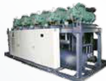
◆ Compressor Set Unit Cooling Capacity Range: 56KW~847KW Min. Evaporation Temperature: -45°C