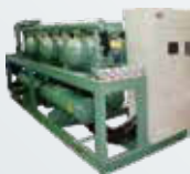
◆ Parallel Condensing Unit Cooling Capacity Range: 26KW~1150KW Min. Evaporation Temperature: -45°C