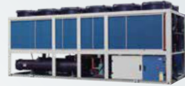
◆ R1234ze Heat Pump Cooling Capacity Range: 10KW~2000KW Chilled water outlet temperature range: 6~20°C Heating Capacity Range: 15KW~2110KW Hot Water Outlet Temperature Range: 45~85°C Ambient Temperature Range: -35~53°C Chilled Water Temp.: 5~35°C