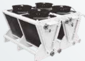
◆ Dry Coolers