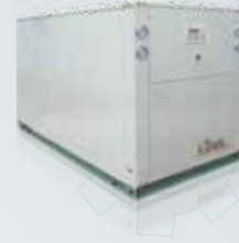
◆ Water Source Heat Pump Unit Cooling capacity of air conditioning mode: 15.2KW~336KW Hot water mode heating capacity: 16.6KW~336.7KW Heating mode cooling capacity: 17.3KW~360.6KW Chilled water outlet temperature range: 5~20°C Hot water outlet temperature: 55°C