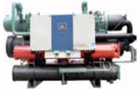
◆ (Heat Recovery) Water Source Heat Pump Cooling Capacity Range: 98KW~3272KW Chilled water outlet temperature range: 5~20°C