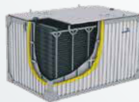
◆ Ice storage tank (for air condition use)