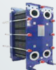
◆ Plate heat exchanger