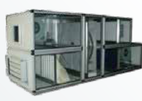
◆ Modular Air Handling Unit