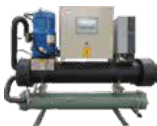
◆ Water-cooled Scroll Inverter Chiller Cooling Capacity Range: 92KW~1526KW Chilled water outlet temperature range: 5~20°C