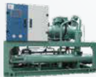
◆ Condensing Unit Cooling Capacity Range: 17KW~2218KW Min. Evaporation Temperature: -40°C