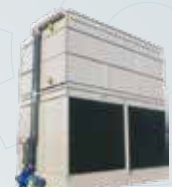
◆ Evaporative Condenser Heat Exchange Capacity Range: 224KW~1770KW